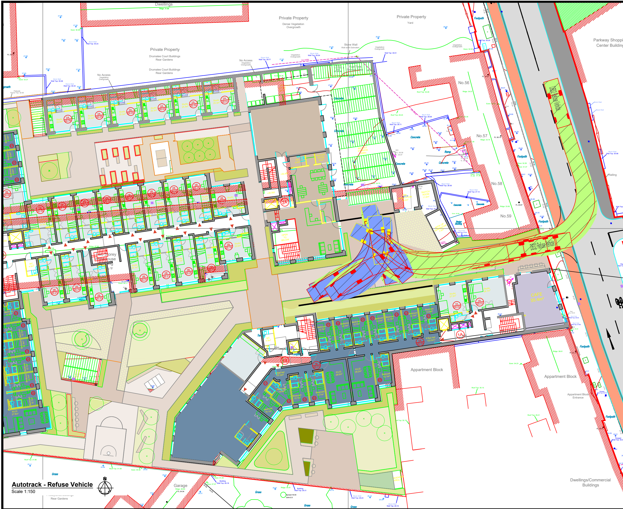
Autotrack - Refuse Vehicle Scale 1:150